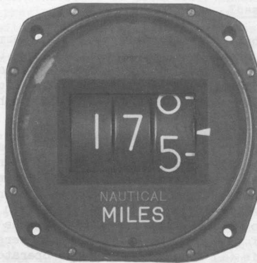
Figure 1: Typical Counter

Counters of the general type shown in Figure 1 are becoming an increasingly popular method of displaying information to aircrew members. This is probably due to the increased precision required in operating airborne equipment and to the recognized advantages of a counter in presenting multi-digit numbers such as Longitude W 172° 38'.